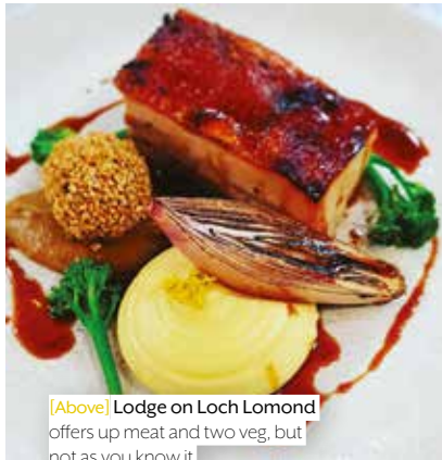
[Above] Lodge on Loch Lomond offers up meat and two veg, but not as you know it