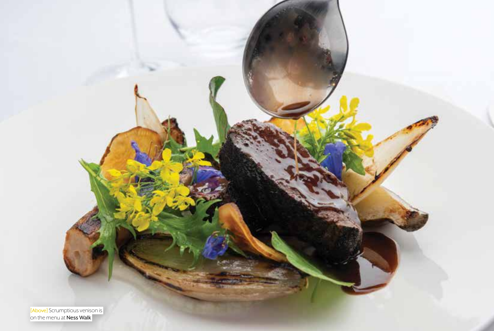
[Above] Scrumptious venison is on the menu at Ness Walk