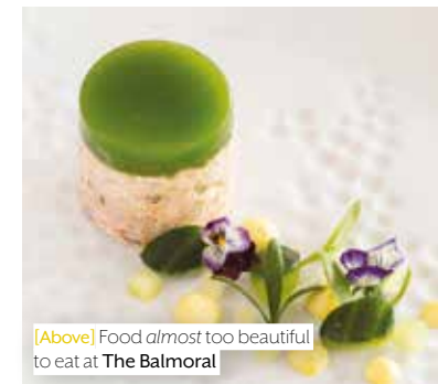
[Above] Food almost too beautiful to eat at The Balmoral

"Our team in the kitchen love a challenge, so pulling together the dream menu to complement the perfect day is where we all get the chance to be creative." Count us in.