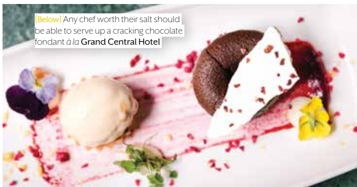
[Below] Any chef worth their salt should be able to serve up a cracking chocolate fondant à la Grand Central Hotel

“WE HAVE PUT GREAT CARE AND THOUGHT INTO CREATING A SET OF MENUS THAT USE SOME OF THE BEST LOCAL PRODUCE”