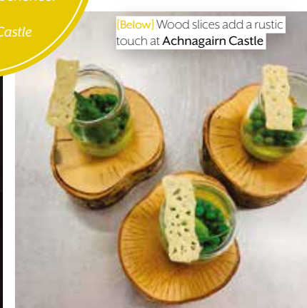
[Below] Wood slices add a rustic touch at Achnagairn Castle

Got eyes bigger than your belly? You're not alone. A very hungry Zoë Boothby searches out Scotland's best foodie venues, all guaranteed to dish up a meal to remember