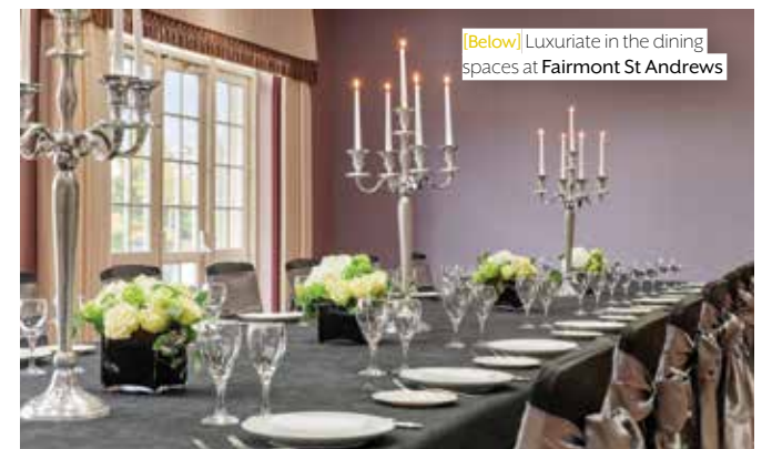
[Below] Luxuriate in the dining spaces at Fairmont St Andrews