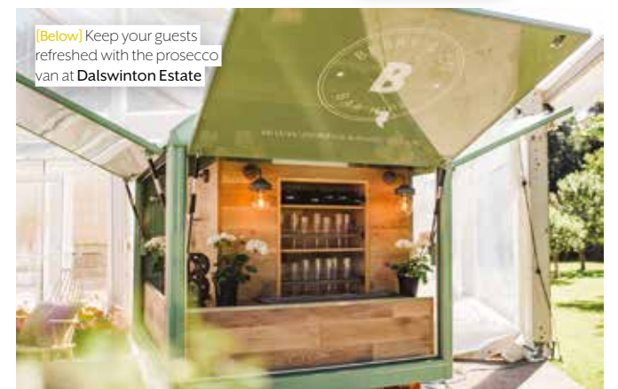
[Below] Keep your guests refreshed with the prosecco van at Dalswinton Estate