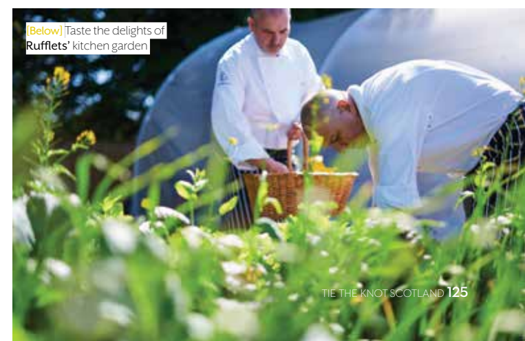
[Below] Taste the delights of Rufflets' kitchen garden