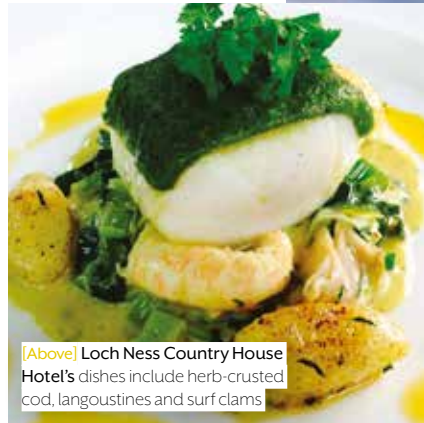
[Above] Loch Ness Country House Hotel's dishes include herb-crusted cod, langoustines and surf clams