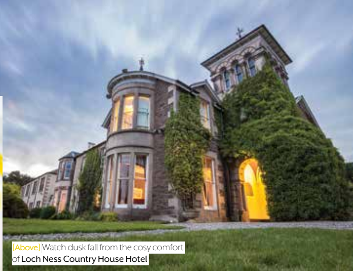
[Above] Watch dusk fall from the cosy comfort of Loch Ness Country House Hotel

“WE HAVE PUT GREAT CARE AND THOUGHT INTO CREATING A SET OF MENUS THAT USE SOME OF THE BEST LOCAL PRODUCE”