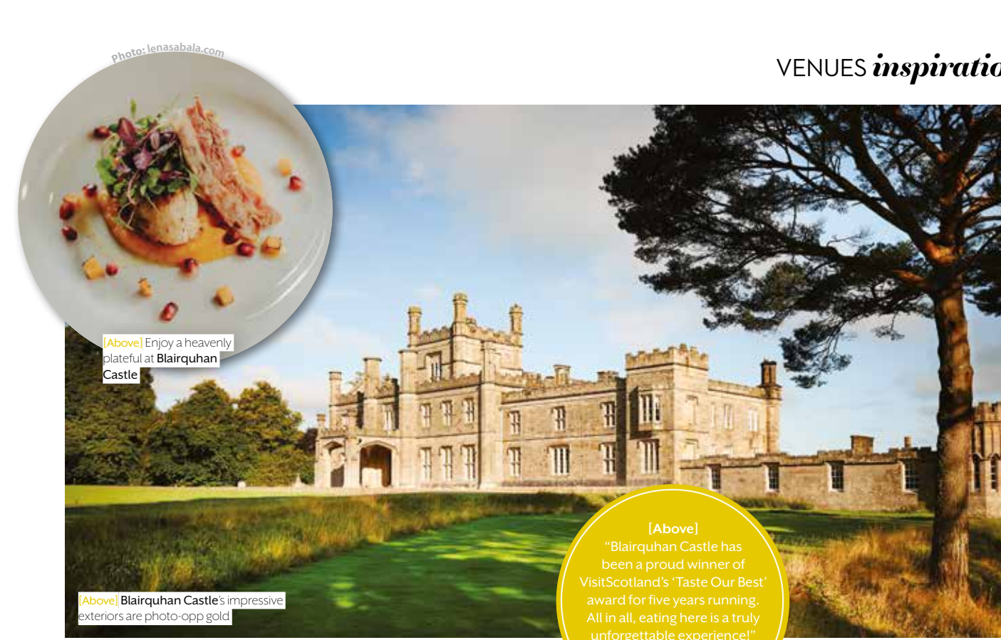
[Above] Enjoy a heavenly plateful at Blairquhan Castle