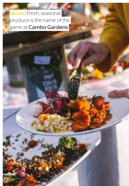
[Below] Fresh, seasonal produce is the name of the game at Cambo Gardens