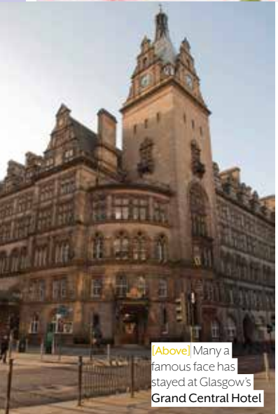
[Above] Many a famous face has stayed at Glasgow's Grand Central Hotel