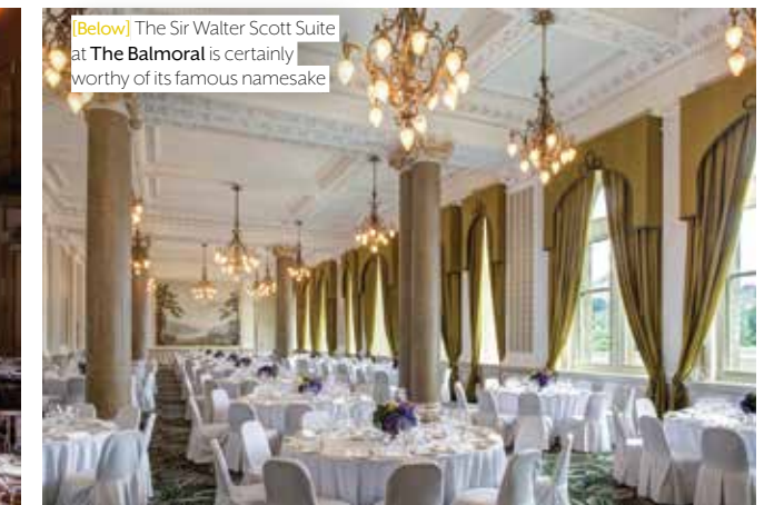
[Below] The Sir Walter Scott Suite at The Balmoral is certainly worthy of its famous namesake